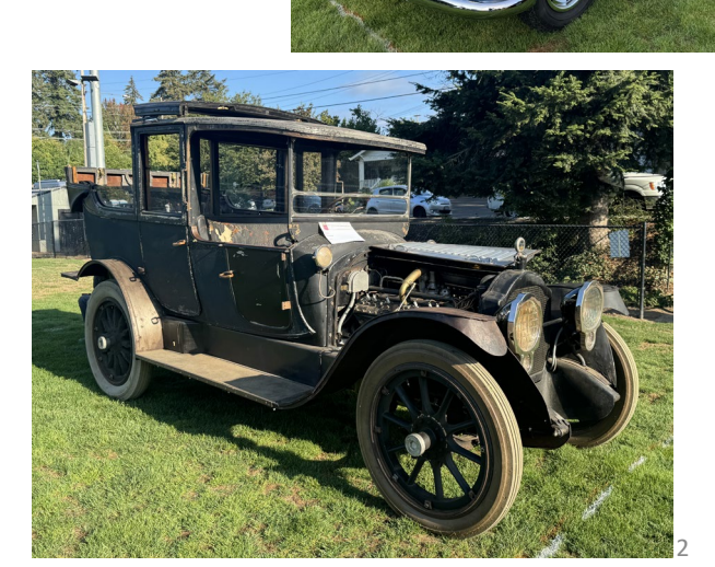
Brake Cables - September 2024